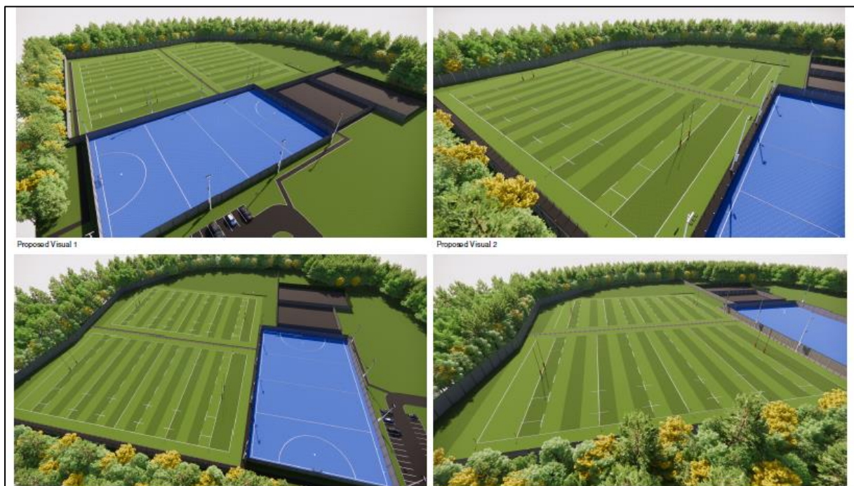
Illustration 1 – Proposed Visuals for the new Pitches at Sue Noake

The existing surface will be enhanced and will be made more durable for extended use by an external pitch specialist. The specific works are set out below: