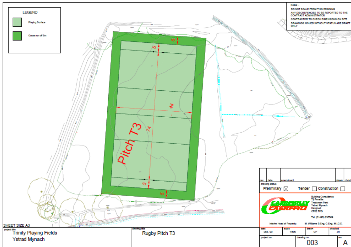
Illustration 3 – Proposed Mini and Junior Pitch Layout at Trinity 3

The playing surface will be enhanced and will receive verti draining treatments and regular maintenance to enhance its playability.