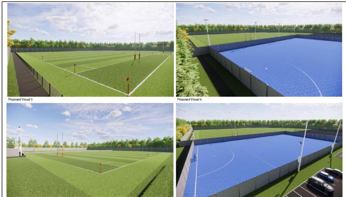
Illustration 2 – Proposed Visuals for the new Pitches at Sue Noake

The existing playing surface will be enhanced and will be made more durable for extended use by an external pitch specialist. The specific works are set out below: